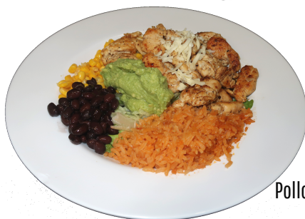
Pollo Asado Bowl