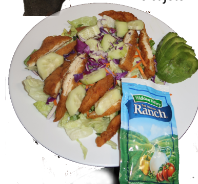
Fried Chicken Salad